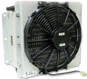
07-34002 Low Profile 14" Fan