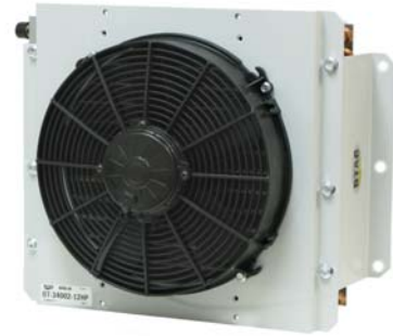
07-34002HP High Profile 12" Fan - 12V Only